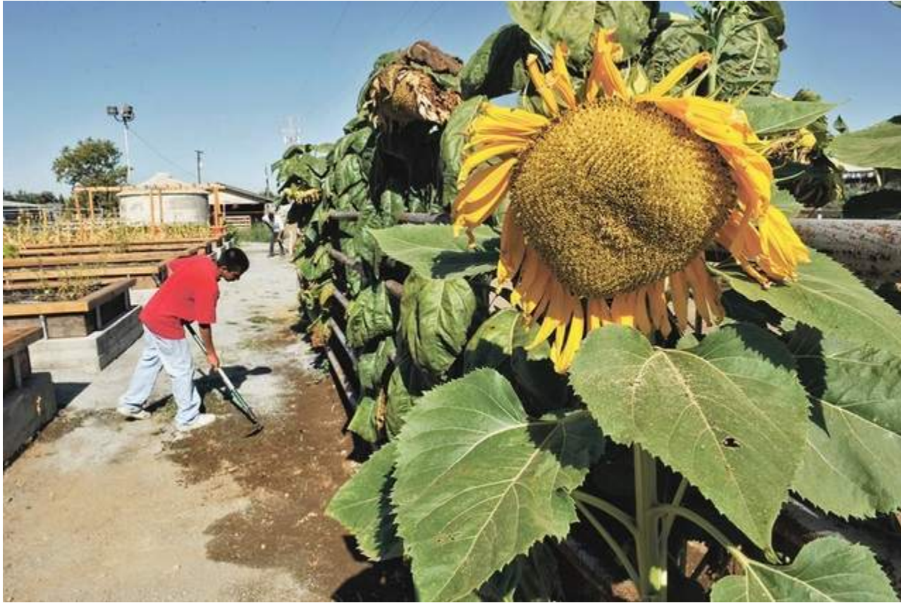
Visalia Times Delta